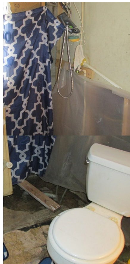
Below the curtain, the 2 x 4 board where Ron stood to shower for 7 years.

There are many families like Ron, who also have no other options, who are waiting to be served. To serve them, we need your help.